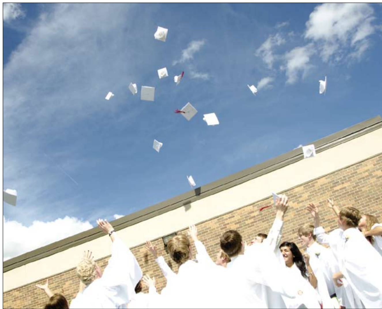
CRB 2011 graduates toss their caps following Commencement exercises Sunday.