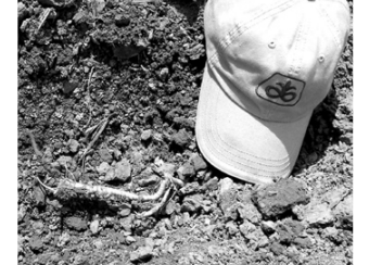
This Miscanthus rhizome is planted less than 2 inches below the surface. The test has three seeding spacing's of 6", 12" and 18" apart in a row. Rows are 40" apart. Plants will take two years to mature.

city rows, they had to work like mad. They admit that this system was fine for one acre, but for larger plantings, a better system is needed. There are commercial planters for rhizomes, of course, but for this test plot, this was adequate. Even at one acre, this experiment is the largest in size in the state of Iowa for biomass production of Giant Miscanthus. Iowa State University and the Southern Iowa Resource Conservation and Development Inc. have smaller test plots of many different varieties of Miscanthus, but no plot is over 12' by 12'. There are no other test fields in northwest Iowa. Because of its form and height, giant Miscanthus can produce twice as much biomass as native switchgrass. Giant Miscanthus grass has been growing for 22 years in Denmark and has not spread beyond five feet from its original planting site. This is important to avoid non-native plants that become invasive over time. Because seeds are sterile, only movement of the rhizomes can spread the plant. Randy Kasperbauer is a 2009 Iowa State University graduate in mechanical engineering. He studied bioenergy methodology as an undergrad. He also currently works with John Deere Company in Des Moines. Denny Kasperbauer lives on the farm and also manages a tiling business.